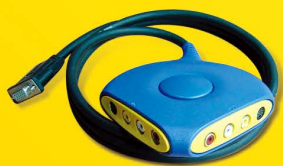
Multifunctional cable assembly