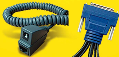
Cable assemblies available in a variety of models