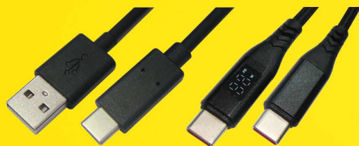
USB Type C cables