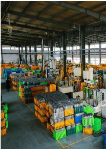
Our workshop of metal working